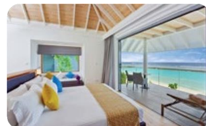
35 2-Bedroom Beach Houses - 205 sqm

Sited amongst the natural gardens of the island, the wooden Beach Villa with Jacuzzi features king-sized four-poster bed and an inviting daybed, whilst the deck outside offers daybed and sunloungers for two. The bathroom is large and open air, and includes a tempting jacuzzi in the corner.