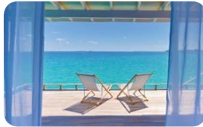
30 Deluxe Water Villas - 115 sqm

These magnificent villas are built on stilts, close to the house reef with its colourful myriad of marine life. The villa features an airy bedroom with king bed and a spacious bathroom with twin vanities and rainfall shower. The villas also include an oversized two-tiered sundeck with your jacuzzi, sunloungers and sun umbrella. Enjoy panoramic views of the Indian Ocean.