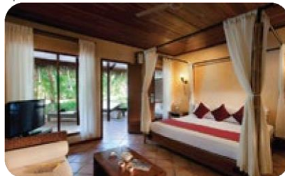
71 Beach Villas - 70 sqm

machine with complimentary refill is included from this villa category upwards.