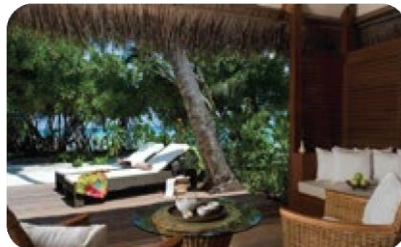
31 Deluxe Beach Villas with Jacuzzi - 95 sqm

The Beach Villas are individual villas hidden within the abundant vegetation, yet only a few steps away from the beach. Facing the lagoon side of the island, they feature king-sized four-poster beds, wooden decks at the front with daybed and sunloungers. The Beach Villas also include semi-open air bathrooms with outdoor rainfall shower.