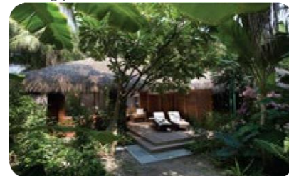
33 Beach Villas with Jacuzzi - 90 sqm

vanities, and a large outdoor area with a rainfall shower, outdoor daybed, and an inviting jacuzzi on an elevated deck.