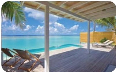
12 Pool Villas - 165 sqm

The Water Villas with Pool are located either in the crystal clear lagoon or facing the house reef, all featuring modern interiors similar to the Deluxe Water Villas. These villas also include a private pool (18sqm) overlooking the ocean.