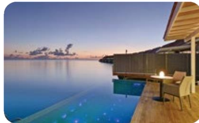
16 Thundi Water Villas with Pool - 142 sqm

Designed for couples celebrating romance, these are large one bedroom villas with a separate living area. The bedroom features a king-sized bed and a daybed, whilst the living area includes an inviting sofa and a large flat screen