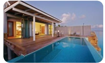
33 Water Villas with Pool - 142 sqm

Set in the middle of our vast turquoise lagoon, the Deluxe Water Villa feature a king-sized bed and a daybed. The spacious bathroom offers a freestanding bath, and opens onto an expansive deck with steps down to the azure waters. In addition to the wide range of in-villa amenities, all villas from this category upwards also feature a fuller minibar complete with a separate wine chiller featuring over 30 bottles from around the globe.