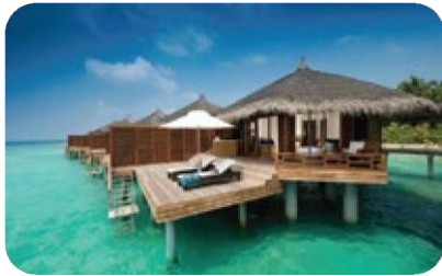
50 Water Villas with Jacuzzi - 90 sqm

These magnificent villas are built on stilts, close to the house reef with its colourful myriad of marine life. The villa features an airy bedroom with king bed and a spacious bathroom with twin vanities and rainfall shower. The villas also include an oversized two-tiered sundeck with your jacuzzi, sunloungers and sun umbrella. Enjoy panoramic views of the Indian Ocean.