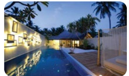
2 Honeymoon Pool Villas - 310 sqm

TV, DVD player and an espresso machine. A private sanctuary at the back features an open air bathroom with twin vanities, large ceiling LED-lit shower, a bath for two and an air-conditioned lounge. A 10 metre lap pool completes this piece of heaven.