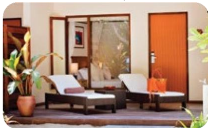
12 Garden Villas - 45 sqm

Check-in is at 14:00hrs, check-out is at 12:00hrs.