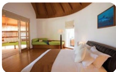
35 Superior Beach Villas with Jacuzzi - 90 sqm

With four built together, the Garden Villas are simple yet stylish and feature a semi-open air bathroom with rainfall shower. Close to the beach and the pristine blue waters, they provide for our most affordable Kuramathi experience.